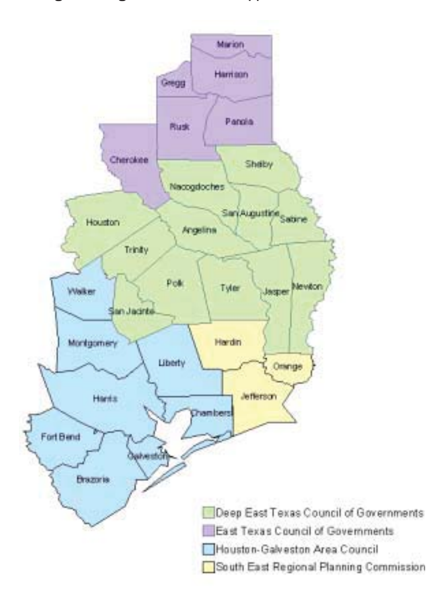
Figure 1. Eligible Counties and Applicants